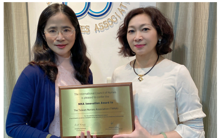
▲ ICN NNA Innovation Award (2021)