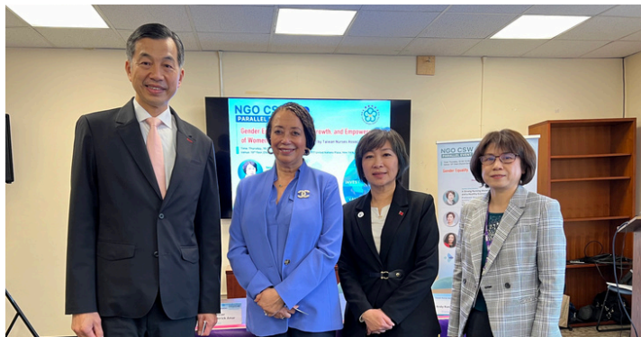
▲ NGO CSW Parallel Event (2024)