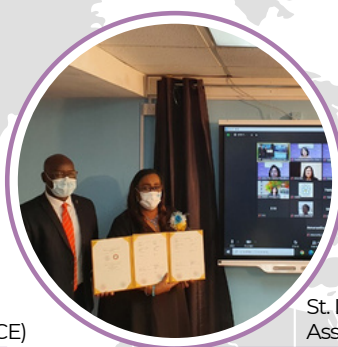
St. Lucia Nurses Association (SLNA)