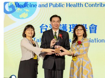
▲ Medicine and Public Health Contribution Award (2020)