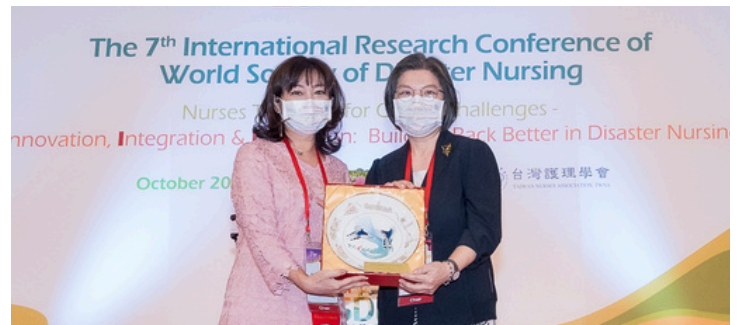
▲ 7th WSDN (2022)