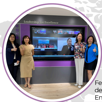
Federación Mexicana de Colegios de Enfermería, AC (FEMCE)