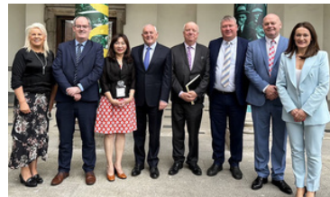
▲ Spoke at the Irish Parliament (2023)