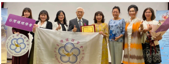
▲ 7th International Medical Model Award (2022)