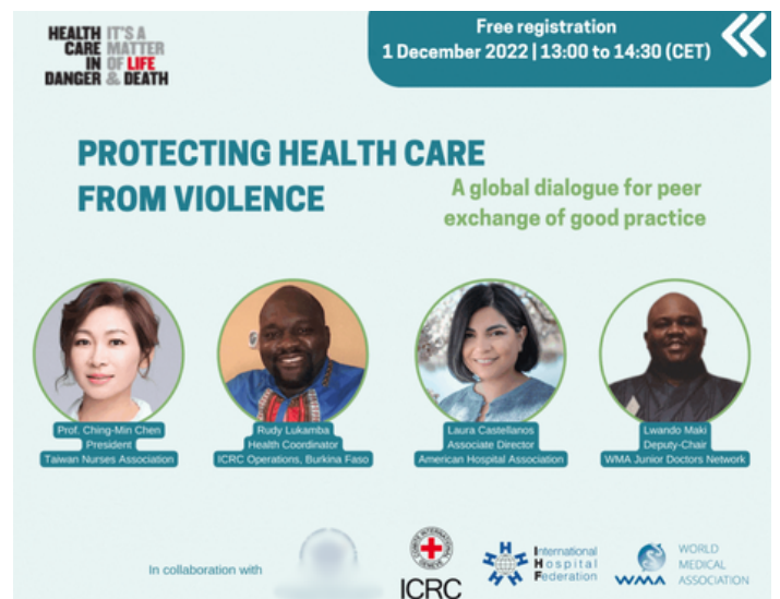
▲ Spoke at the ICN, WMA, IHF, and ICRC Joint Webinar on Protecting Healthcare from Violence (2022)