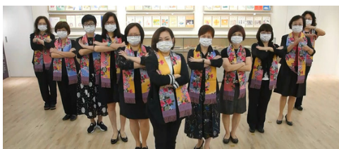
◀ ICN Virtual Congress (2021)

“With Advocacy , Commitment , and Enthusiasm —together, we ACE the future of nursing! I count on your support!”