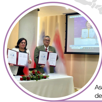
Asociación Paraguaya de Enfermeras (APE)