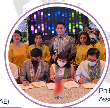
Philippine Nurses Association (PNA)