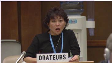
▲ 71st WHA (2018)