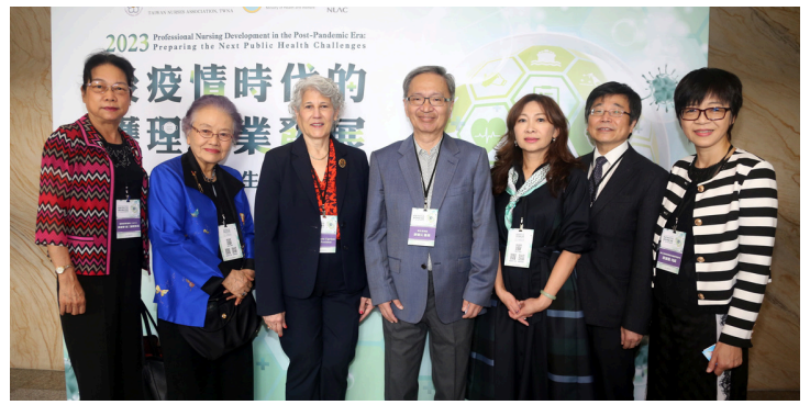
▲ Professional Nursing Development in the Post-Pandemic Era: Preparing the Next Public Health Challenges (2023)