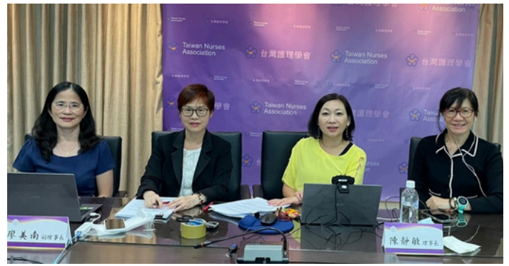
▲ ICN Virtual CNR (2021)