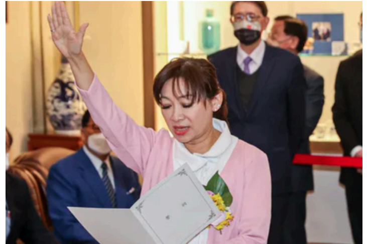
▲ Swearing in as Legislator (2022)