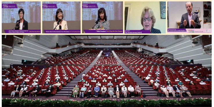
▲ TWINC (2020)