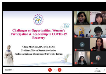
▲ NGO CSW Virtual Parallel Event (2021)