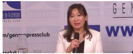
◀ International Press Conference (2023)