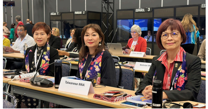
▲ ICN CNR (2023)