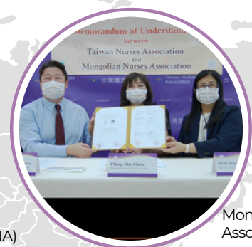
Mongolian Nurses Association (MNA)