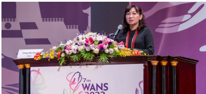
▲ 7th WANS (2022)