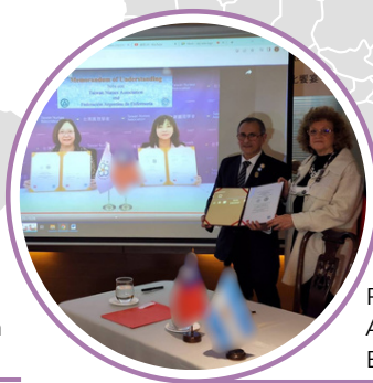
Federación Argentina de Enfermería (FAE)