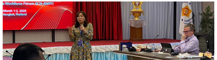
▲ ICN Asia Workforce Forum (2023)